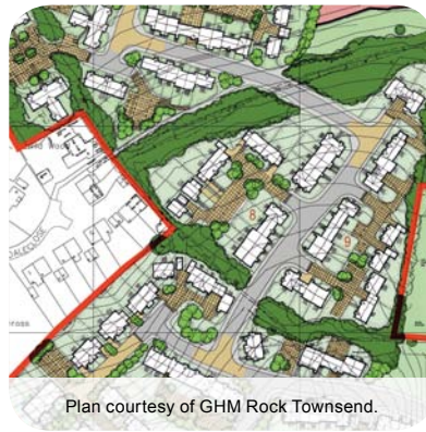
Plan courtesy of GHM Rock Townsend.